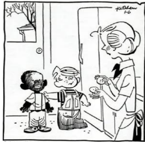
"ME 'N JACKSON ARE EXACTLY THE SAME AGE. ONLY HE'S DIFFERENT. HE'S LEFT-HANDED!"

"A professor gave a balloon to every student, who had to inflate it, write their name on it and throw it in the hallway. After the professor mixed all the balloons up, the students were given 5 minutes to find their own balloon. Despite a hectic search, no one found their balloon.